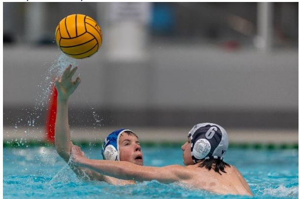
WPV Annual Report 2023/2024 Page 3 of 33

* Other includes supporters, parents, coaches, referees and table officials who have registered through Rev Sport